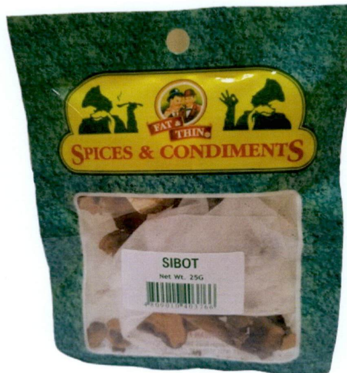
Figure 1. Unregistered FAT & THIN SPICES & CONDIMENTS Sibot

The Food and Drug Administration (FDA) warns all healthcare professionals and the general public NOT TO PURCHASE AND CONSUME the unregistered food product: