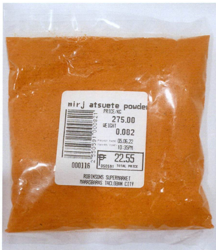
Figure 1. Unregistered MIRJ Atsuete Powder

The Food and Drug Administration (FDA) warns all healthcare professionals and the general public NOT TO PURCHASE AND CONSUME the unregistered food product: