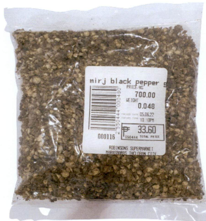
Figure 1. Unregistered MIRJ Black Pepper

The Food and Drug Administration (FDA) warns all healthcare professionals and the general public NOT TO PURCHASE AND CONSUME the unregistered food product: