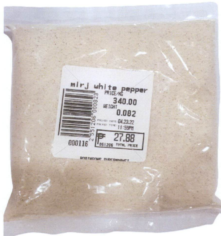
Figure 1. Unregistered MIRJ White Pepper

The Food and Drug Administration (FDA) warns all healthcare professionals and the general public NOT TO PURCHASE AND CONSUME the unregistered food product: