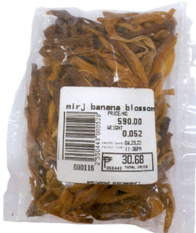
Figure 1. Unregistered MIRJ Banana Blossom

The Food and Drug Administration (FDA) warns all healthcare professionals and the general public NOT TO PURCHASE AND CONSUME the unregistered food product: