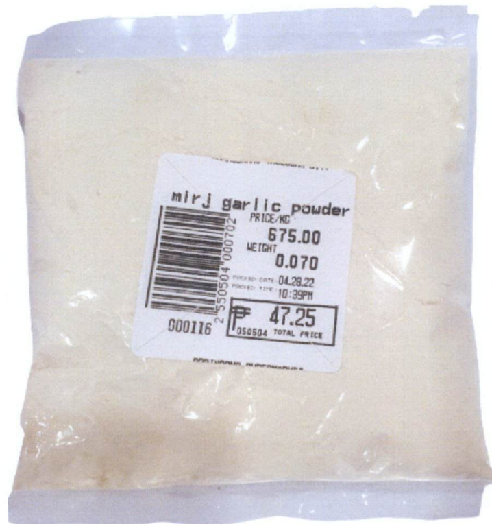
Figure 1. Unregistered MIRJ Garlic Powder

The Food and Drug Administration (FDA) warns all healthcare professionals and the general public NOT TO PURCHASE AND CONSUME the unregistered food product: