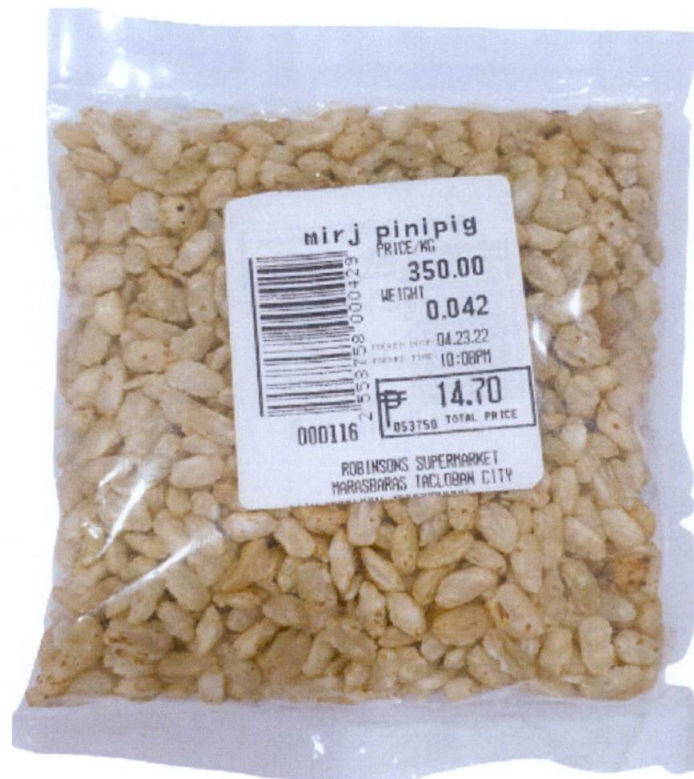
Figure 1. Unregistered MIRJ Pinipig

The Food and Drug Administration (FDA) warns all healthcare professionals and the general public NOT TO PURCHASE AND CONSUME the unregistered food product: