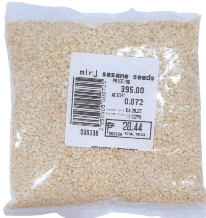
Figure 1. Unregistered MIRJ Sesame Seeds

The Food and Drug Administration (FDA) warns all healthcare professionals and the general public NOT TO PURCHASE AND CONSUME the unregistered food product: