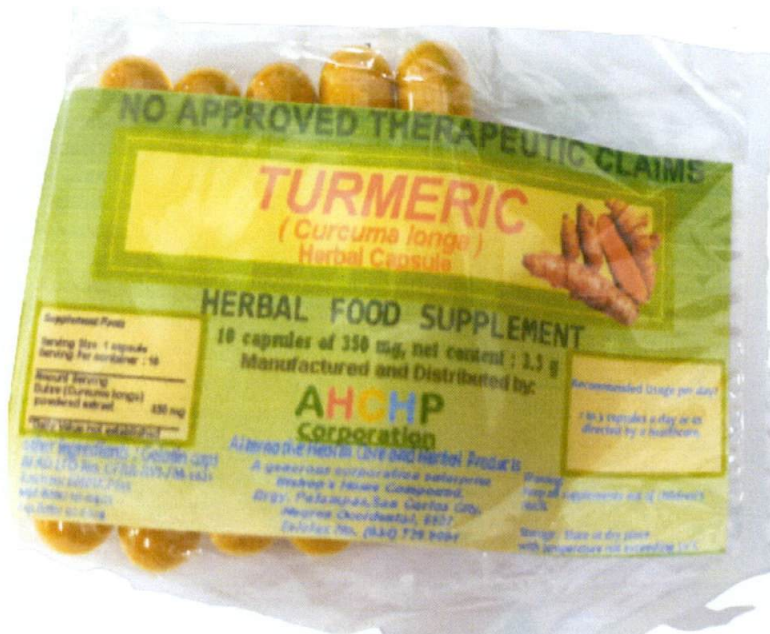
Figure 1. Unregistered (UNBRANDED) Turmeric (Curcuma Longa) Herbal Capsule – Herbal Food Supplement

The Food and Drug Administration (FDA) warns all healthcare professionals and the general public NOT TO PURCHASE AND CONSUME the unregistered food supplement: