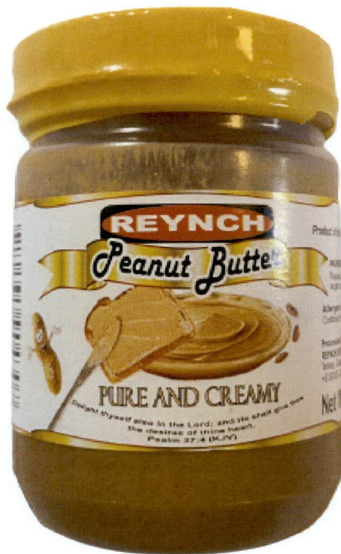
Figure 1. Unregistered REYNCH Peanut Butter

The Food and Drug Administration (FDA) warns all healthcare professionals and the general public NOT TO PURCHASE AND CONSUME the unregistered food product: