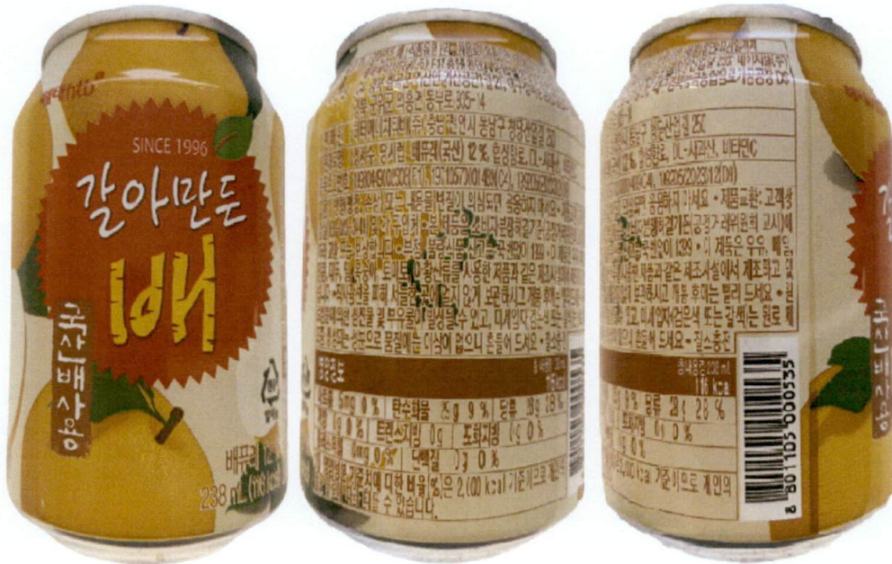
Figure 1. Unregistered (IN FOREIGN LANGUAGE) Product Packed in Tin Can Printed with Red and Pear Fruit on the packaging (In Foreign Language)

The Food and Drug Administration (FDA) warns all healthcare professionals and the general public NOT TO PURCHASE AND CONSUME the unregistered food product: