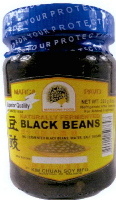
Figure 1. Unregistered MARSONS FOOD MARCA PAVO Naturally Fermented Black Beans

The Food and Drug Administration (FDA) warns all healthcare professionals and the general public NOT TO PURCHASE AND CONSUME the unregistered food product: