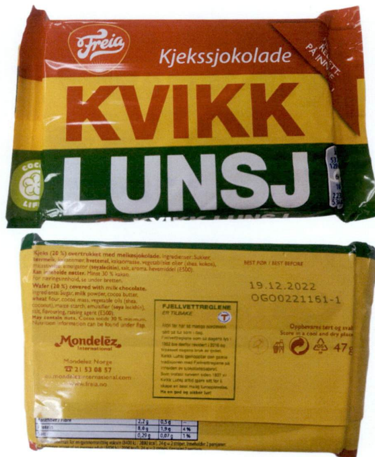
Figure 1. Unregistered FREIA Product in Red, Yellow and Green Packaging with Kjekssjokolade Kvikklunnsj Print (In Foreign Language)

The Food and Drug Administration (FDA) warns all healthcare professionals and the general public NOT TO PURCHASE AND CONSUME the unregistered food product: