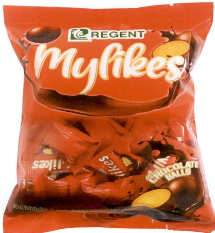
Figure 1. Unregistered REGENT Mylikes Chocolate Balls

The Food and Drug Administration (FDA) warns all healthcare professionals and the general public NOT TO PURCHASE AND CONSUME the unregistered food product: