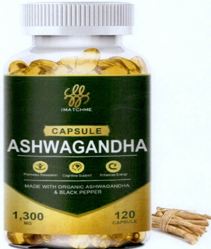
Figure 1. Unregistered IMATCHME Ashwagandha Capsule, 120 Capsules

The Food and Drug Administration (FDA) warns all healthcare professionals and the general public NOT TO PURCHASE AND CONSUME the unregistered food supplement: