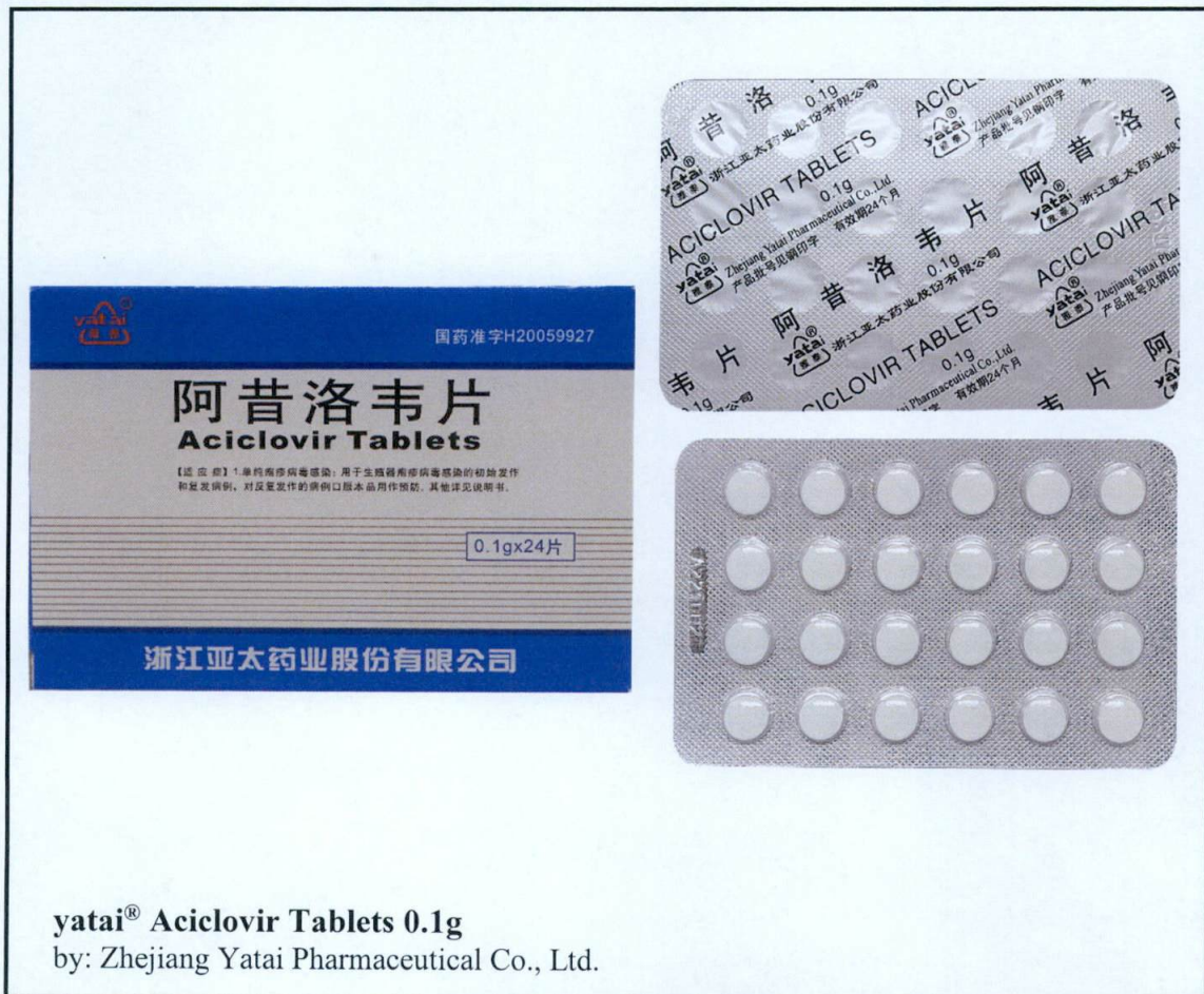
yatai® Aciclovir Tablets 0.1g by: Zhejiang Yatai Pharmaceutical Co., Ltd.

The Food and Drug Administration (FDA) advises the public against the purchase and use of the following unregistered drug products: