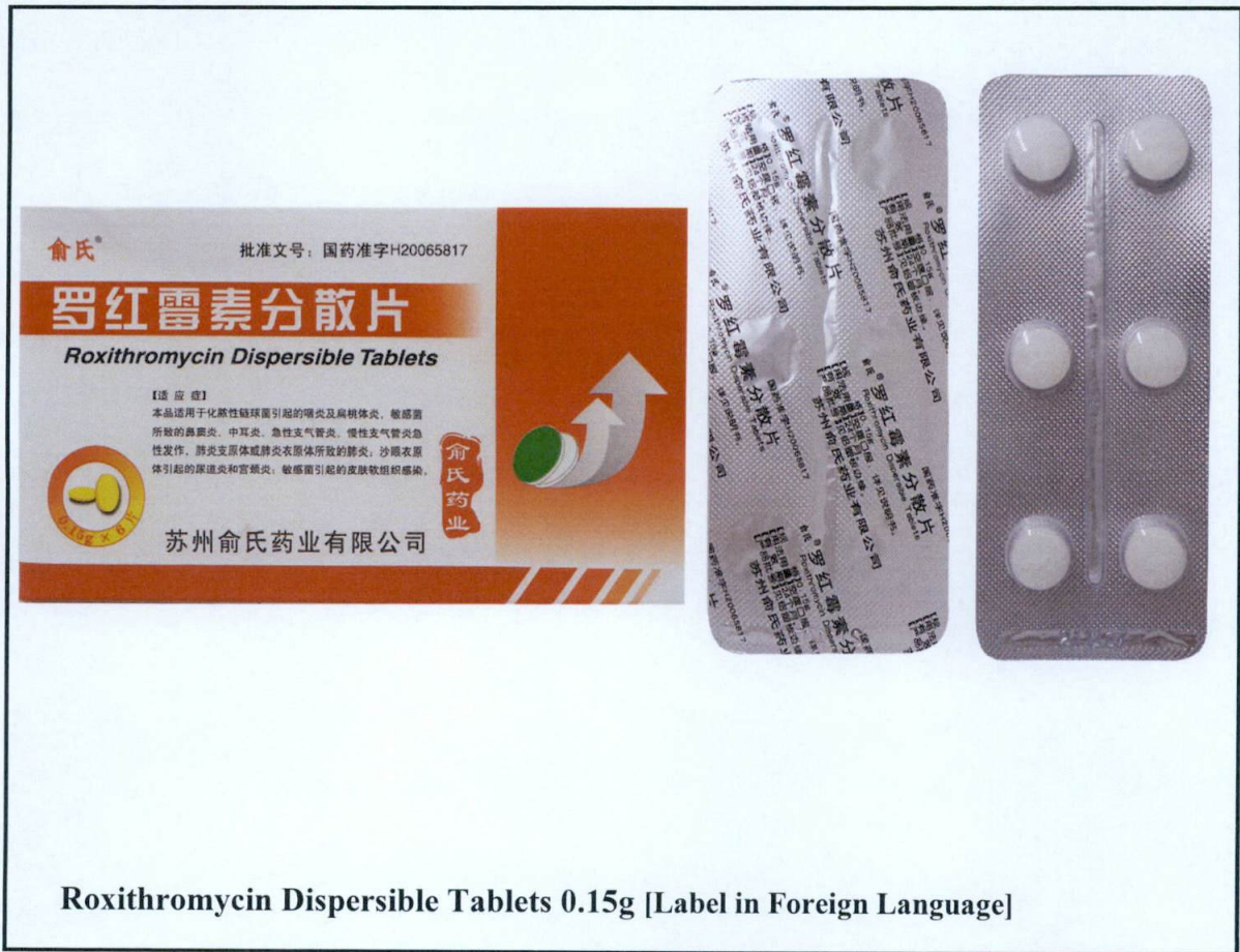
Figure 3. Unregistered drug product