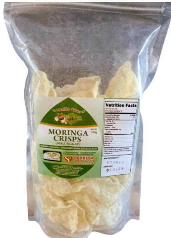
Figure 1. Unregistered HEALTHY CRISPS Moringa Crisps (Malunggay)

The Food and Drug Administration (FDA) warns all healthcare professionals and the general public NOT TO PURCHASE AND CONSUME the unregistered food product: