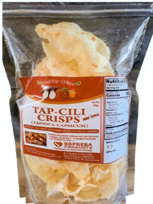
Figure 1. Unregistered HEALTHY CRISPS Tap-Cili Crisps Mild Spicy (Tapioca-Capsicum)

The Food and Drug Administration (FDA) warns all healthcare professionals and the general public NOT TO PURCHASE AND CONSUME the unregistered food product: