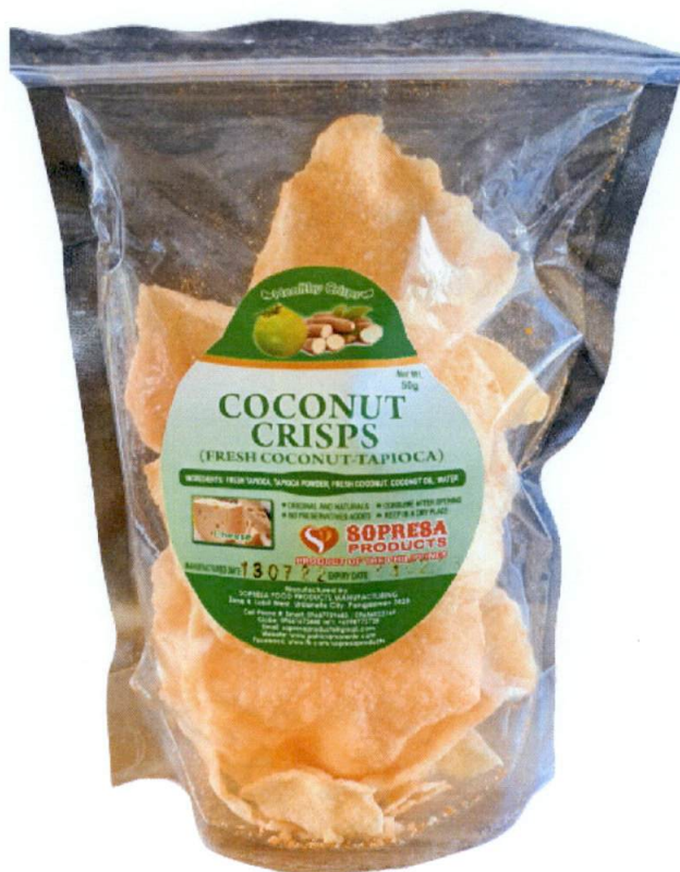
Figure 1. Unregistered HEALTHY CRISPS Coconut Crisps (Fresh Coconut-Tapioca)

The Food and Drug Administration (FDA) warns all healthcare professionals and the general public NOT TO PURCHASE AND CONSUME the unregistered food product: