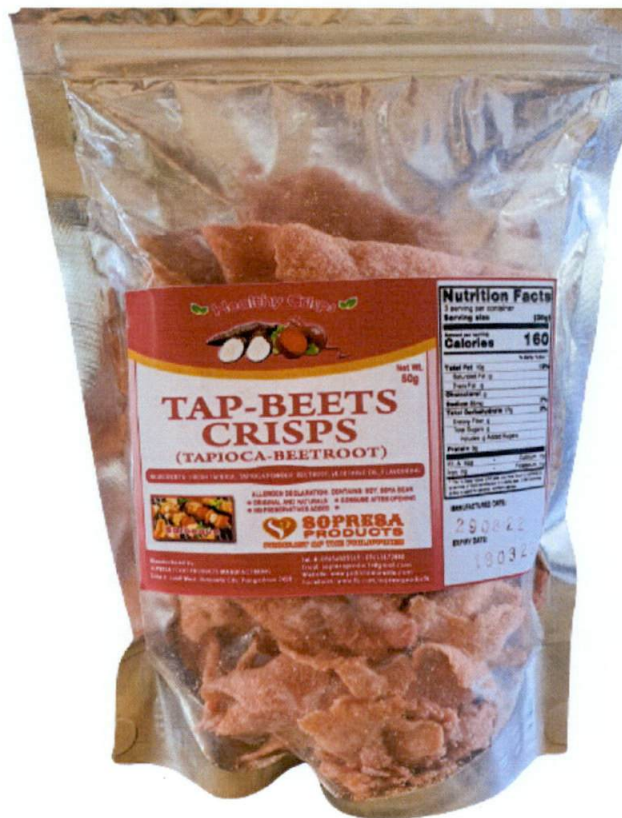
Figure 1. Unregistered HEALTHY CRISPS Tap-Beets Crisps (Tapioca-Beetroot)

The Food and Drug Administration (FDA) warns all healthcare professionals and the general public NOT TO PURCHASE AND CONSUME the unregistered food product: