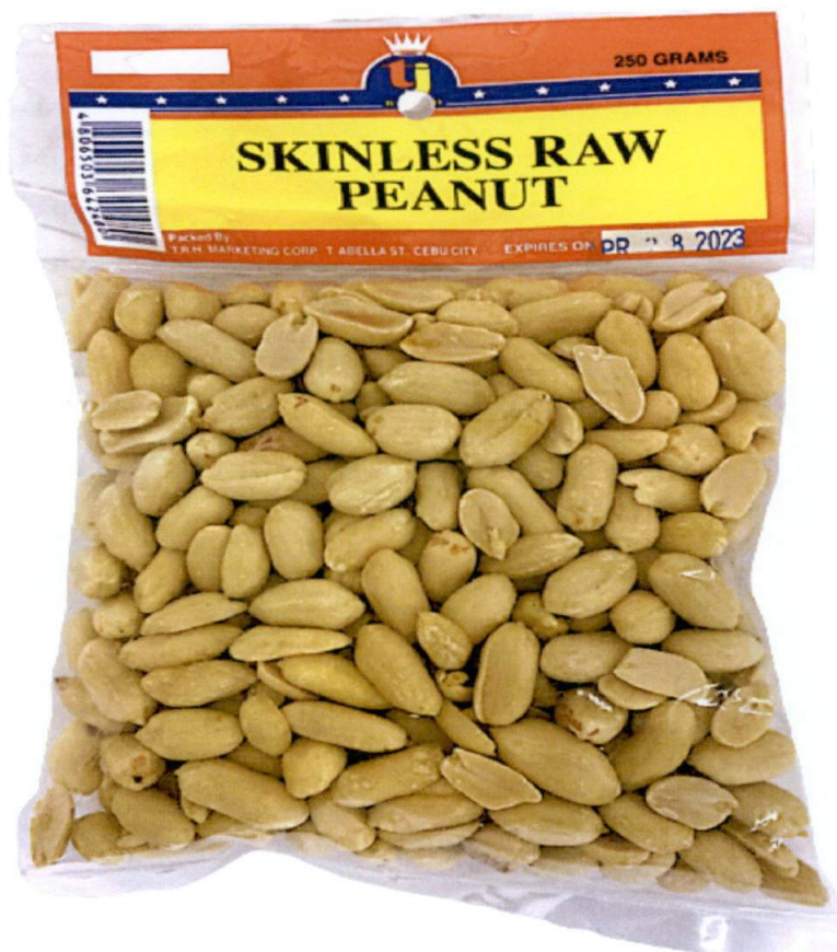
Figure 1. Unregistered TJ Skinless Raw Peanut

The Food and Drug Administration (FDA) warns all healthcare professionals and the general public NOT TO PURCHASE AND CONSUME the unregistered food product: