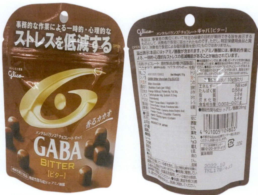
Figure 1. Unregistered GLICO GABA Bitter Chocolate

The Food and Drug Administration (FDA) warns all healthcare professionals and the general public NOT TO PURCHASE AND CONSUME the unregistered food product: