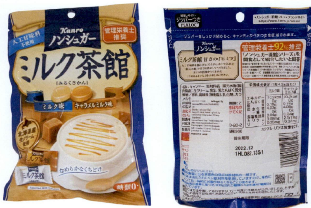
Figure 1. Unregistered KANRO Non-sugar Milk Candy (Assorted Milk Candies)

The Food and Drug Administration (FDA) warns all healthcare professionals and the general public NOT TO PURCHASE AND CONSUME the unregistered food product: