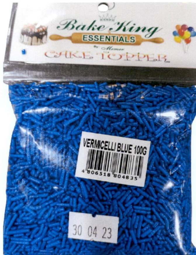
Figure 1. Unregistered BAKE KING ESSENTIALS Cake Topper – Vermicelli Blue

The Food and Drug Administration (FDA) warns all healthcare professionals and the general public NOT TO PURCHASE AND CONSUME the unregistered food product: