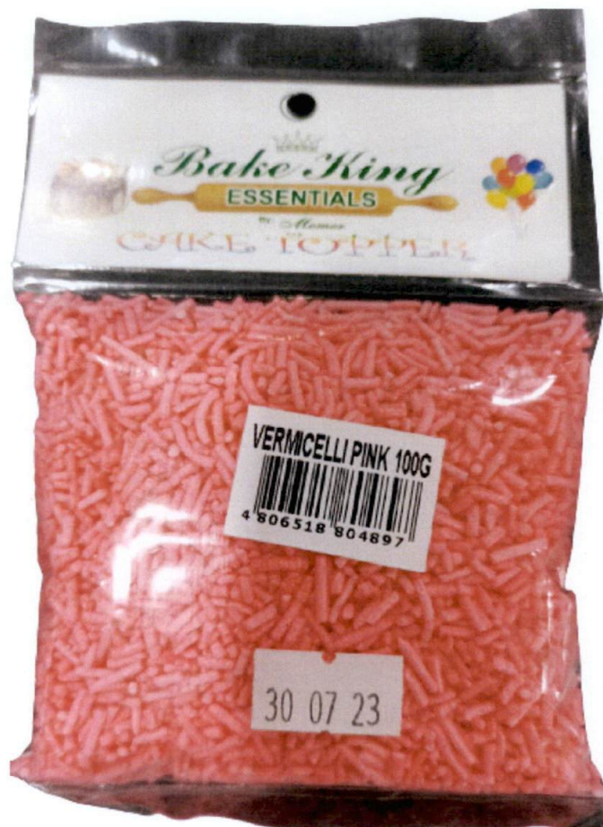
Figure 1. Unregistered BAKE KING ESSENTIALS Cake Topper Vermicelli – Pink

The Food and Drug Administration (FDA) warns all healthcare professionals and the general public NOT TO PURCHASE AND CONSUME the unregistered food product: