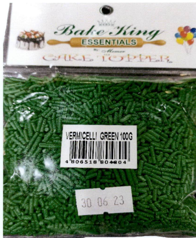
Figure 1. Unregistered BAKE KING ESSENTIALS Cake Topper Vermicelli – Green

The Food and Drug Administration (FDA) warns all healthcare professionals and the general public NOT TO PURCHASE AND CONSUME the unregistered food product: