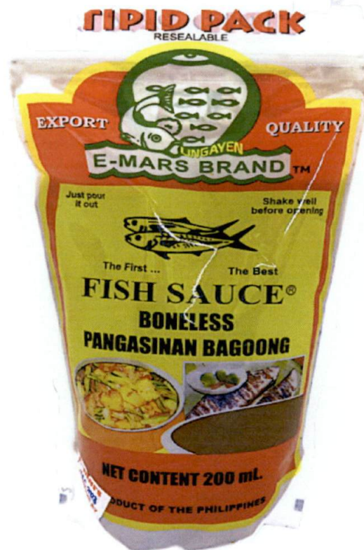
Figure 1. Unregistered LINGAYEN E-MARS BRAND Fish Sauce Boneless Pangasinan Bagoong

The Food and Drug Administration (FDA) warns all healthcare professionals and the general public NOT TO PURCHASE AND CONSUME the unregistered food product: