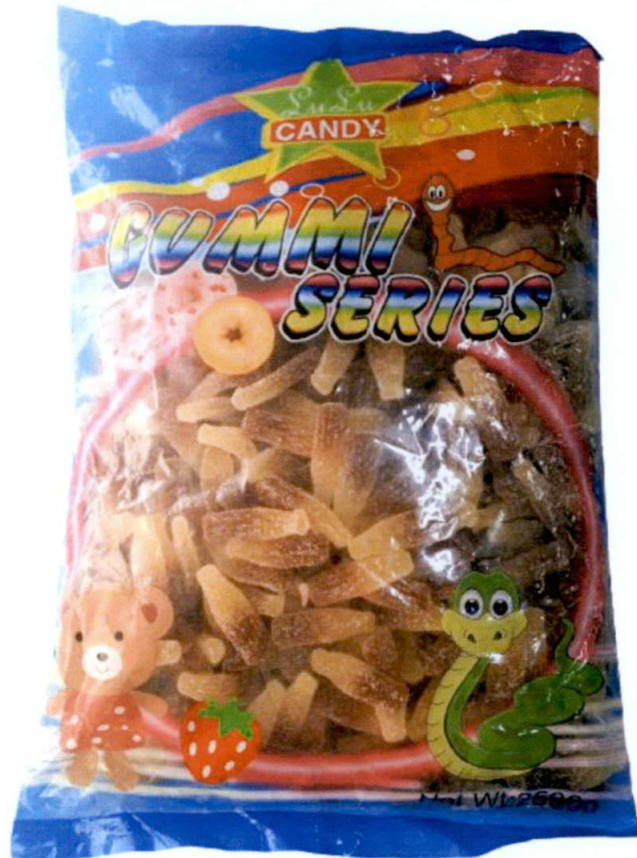
Figure 1. Unregistered LULU CANDY Gummi Series

The Food and Drug Administration (FDA) warns all healthcare professionals and the general public NOT TO PURCHASE AND CONSUME the unregistered food product: