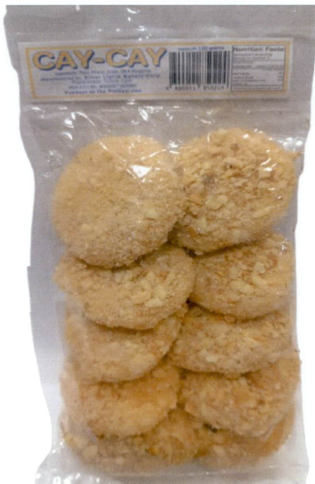
Figure 1. Unregistered (UNBRANDED) Cay-Cay

The Food and Drug Administration (FDA) warns all healthcare professionals and the general public NOT TO PURCHASE AND CONSUME the unregistered food product: