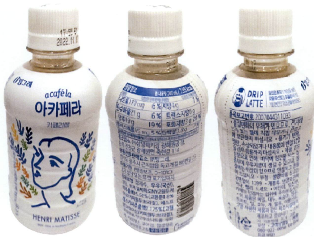
Figure 1. Unregistered A CAFÉ LA Bottle in white and blue packaging with portrait of a woman and leaves (In foreign Language)

The Food and Drug Administration (FDA) warns all healthcare professionals and the general public NOT TO PURCHASE AND CONSUME the unregistered food product: