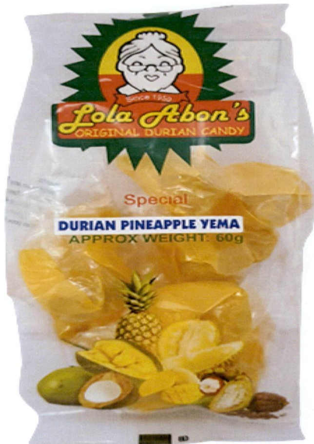
Figure 1. Unregistered LOLA ABON'S ORIGINAL DURIAN CANDY Special Durian Pineapple Yema

The Food and Drug Administration (FDA) warns all healthcare professionals and the general public NOT TO PURCHASE AND CONSUME the unregistered food product: