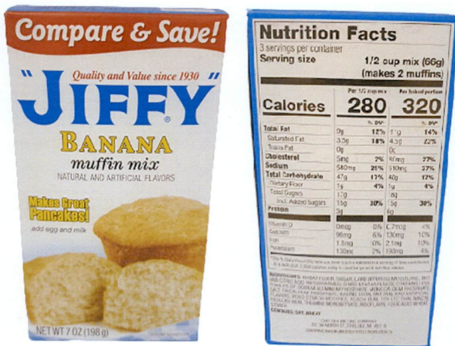
Figure 1. Unregistered JIFFY Banana Muffin Mix

The Food and Drug Administration (FDA) warns all healthcare professionals and the general public NOT TO PURCHASE AND CONSUME the unregistered food product: