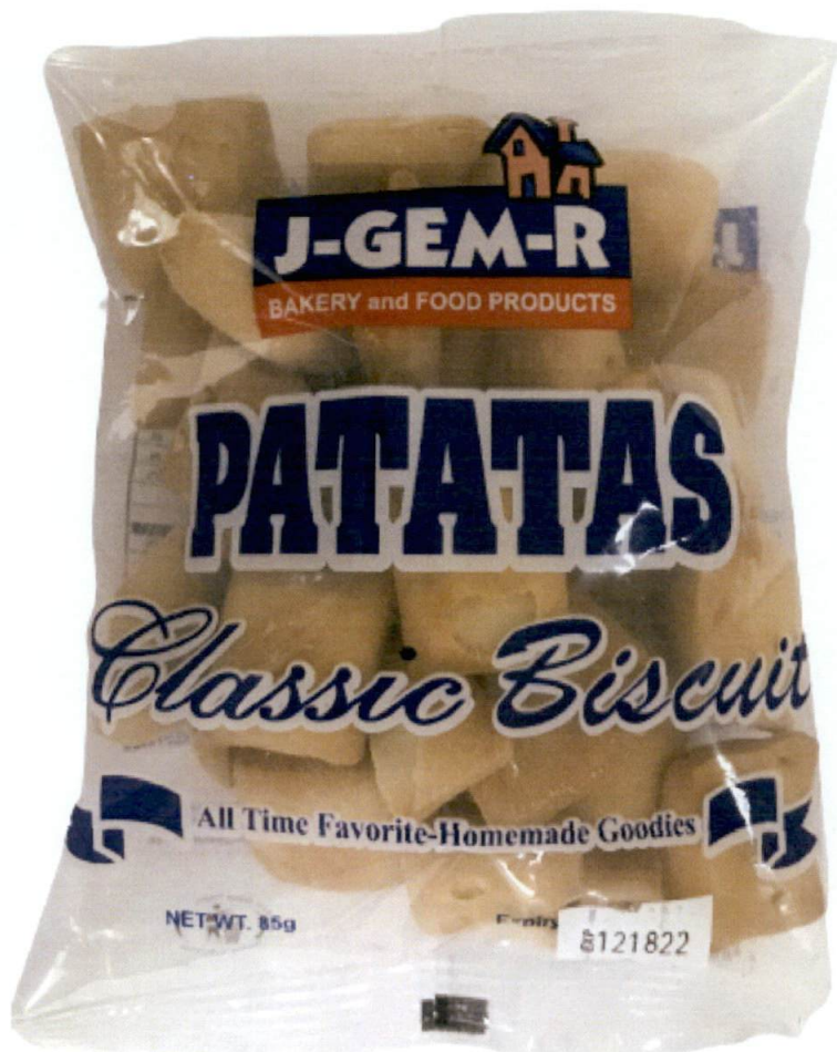
Figure 1. Unregistered J-GEM-R BAKERY AND FOOD PRODUCTS Patatas Classic Biscuit

The Food and Drug Administration (FDA) warns all healthcare professionals and the general public NOT TO PURCHASE AND CONSUME the unregistered food product: