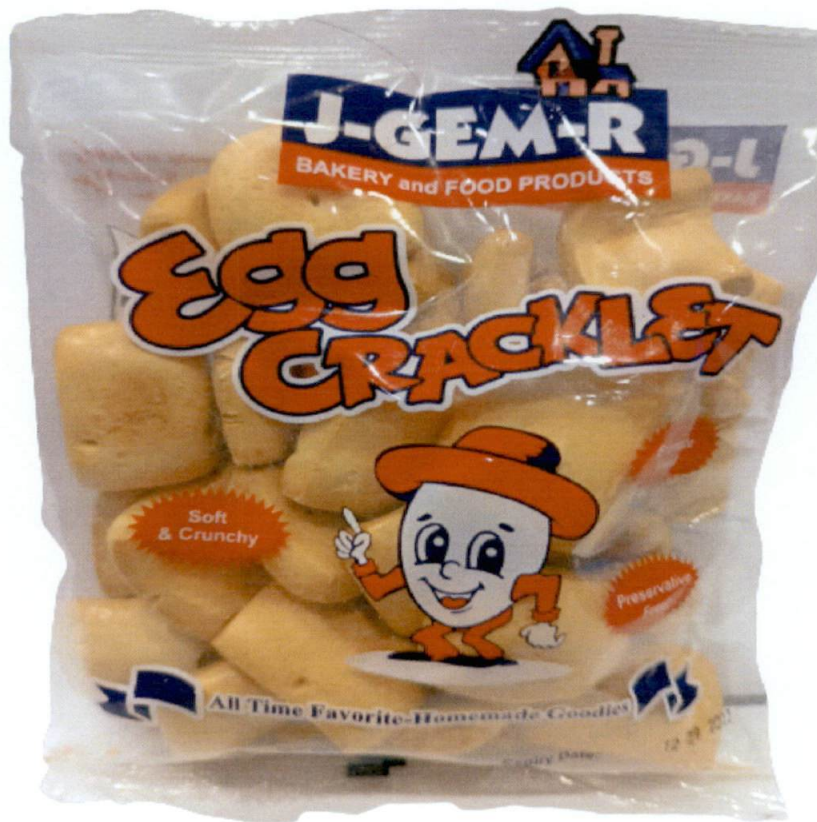
Figure 1. Unregistered J-GEM-R BAKERY AND FOOD PRODUCTS Egg Cracklets

The Food and Drug Administration (FDA) warns all healthcare professionals and the general public NOT TO PURCHASE AND CONSUME the unregistered food product: