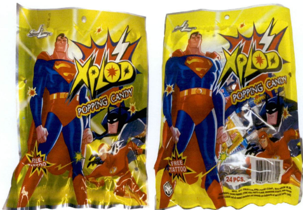
Figure 1. Unregistered JUSTICE LEAGUE XPLOD Popping Candy

The Food and Drug Administration (FDA) warns all healthcare professionals and the general public NOT TO PURCHASE AND CONSUME the unregistered food product: