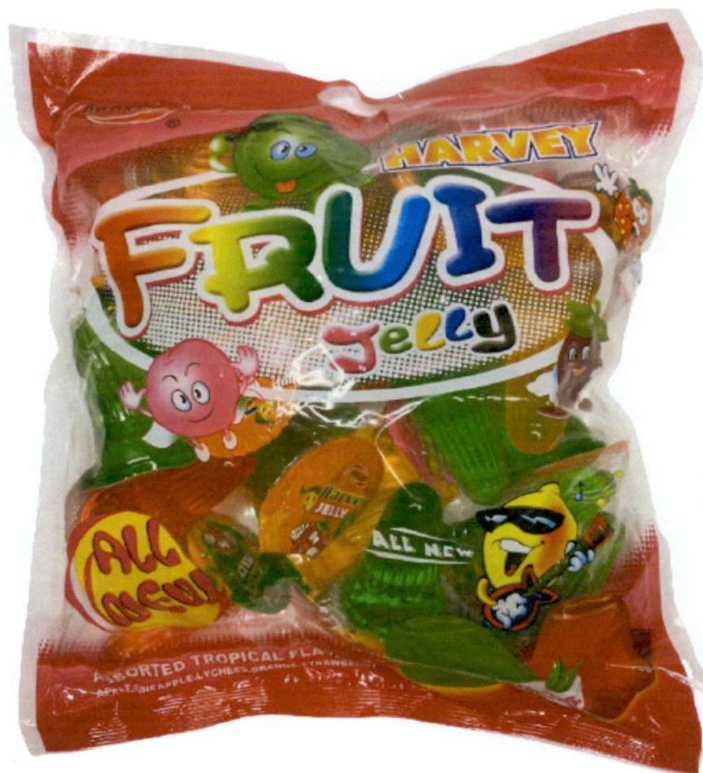
Figure 1. Unregistered HARVEY Fruit Jelly - Assorted Tropical Flavor

The Food and Drug Administration (FDA) warns all healthcare professionals and the general public NOT TO PURCHASE AND CONSUME the unregistered food product: