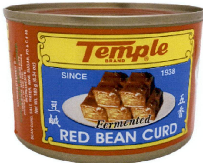
Figure 1. Unregistered TEMPLE BRAND Fermented Red Bean Curd

The Food and Drug Administration (FDA) warns all healthcare professionals and the general public NOT TO PURCHASE AND CONSUME the unregistered food product: