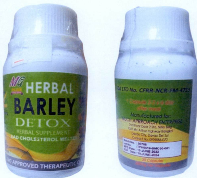
Figure 1. Unregistered MG HERBAL Barley Detox Herbal Supplement

The Food and Drug Administration (FDA) warns all healthcare professionals and the general public NOT TO PURCHASE AND CONSUME the following unregistered food supplements: