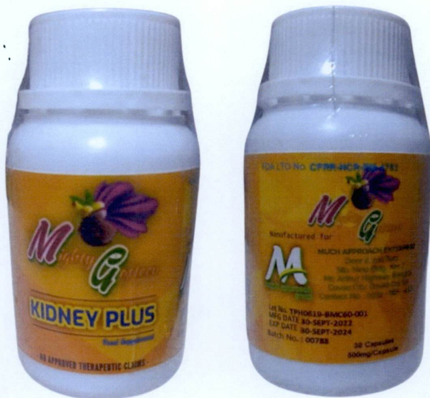
Figure 2. Unregistered MIGHTY GOSTEEN Kidney Plus Food Supplement