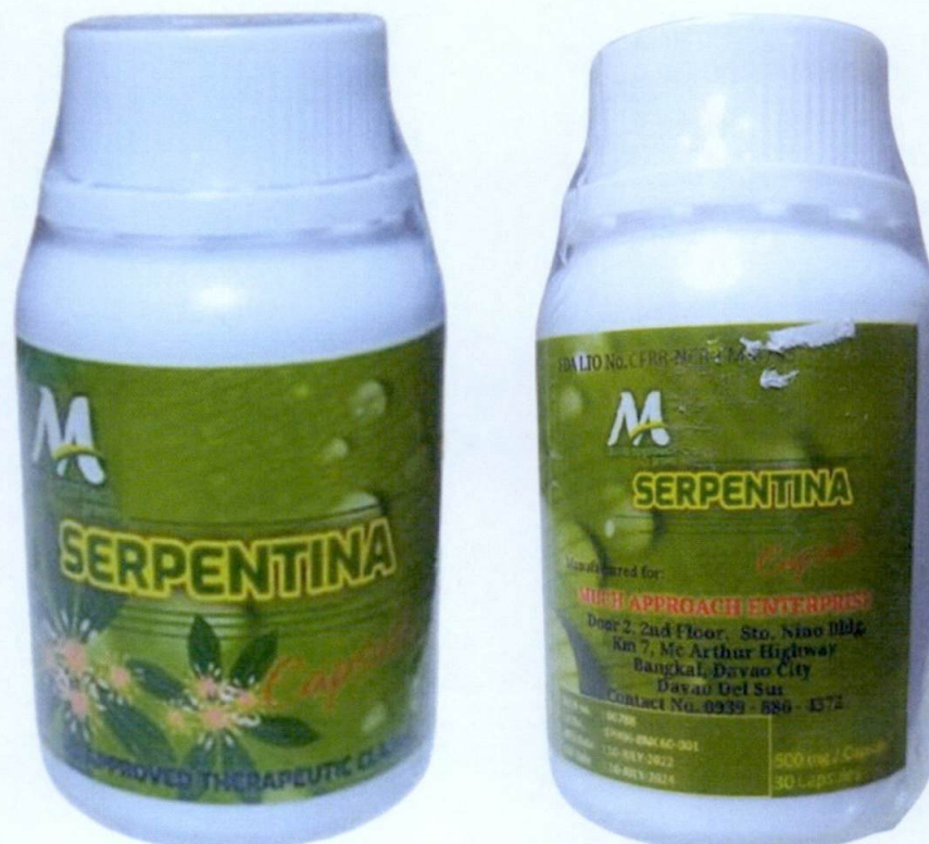
Figure 5. Unregistered M Serpentina Capsule