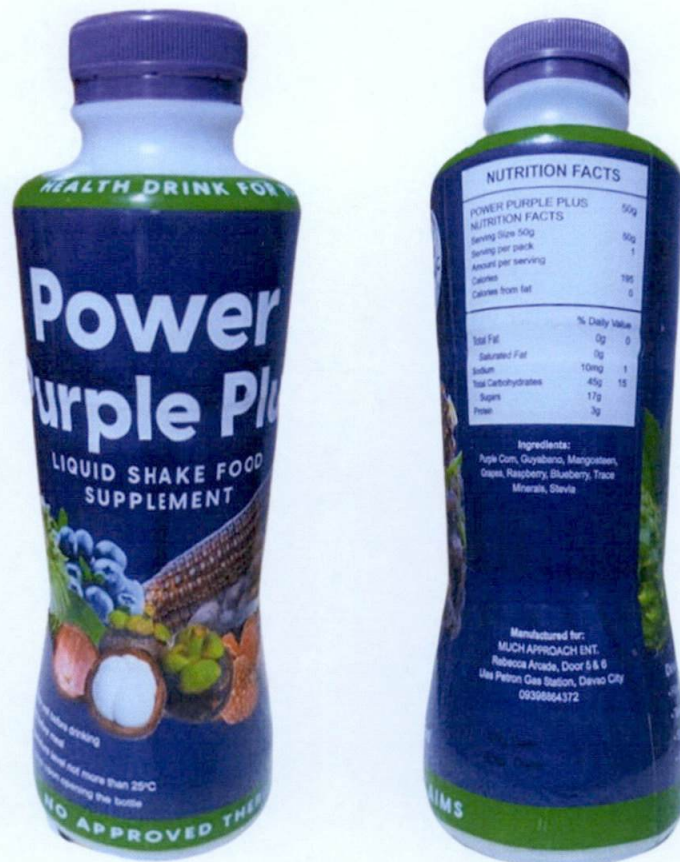
Figure 4. Unregistered POWER PURPLE PLUS Liquid Shake Food Supplement