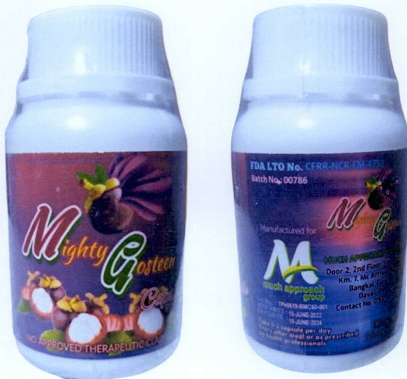
Figure 3. Unregistered MIGHTY GOSTEEN Capsule