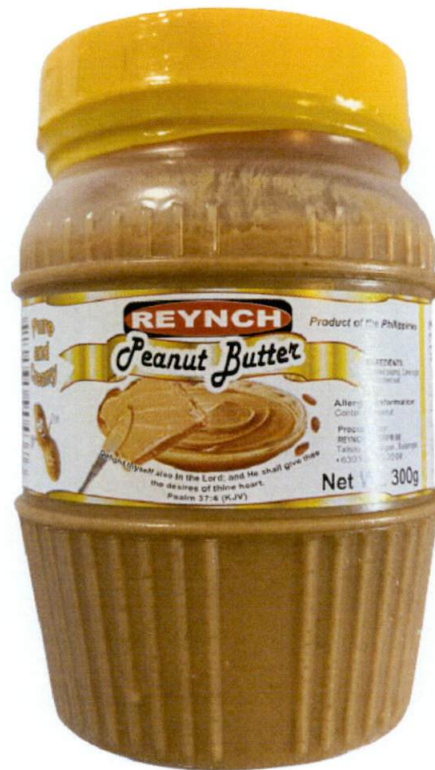
Figure 1. Unregistered REYNCH Peanut Butter

The Food and Drug Administration (FDA) warns all healthcare professionals and the general public NOT TO PURCHASE AND CONSUME the unregistered food product: