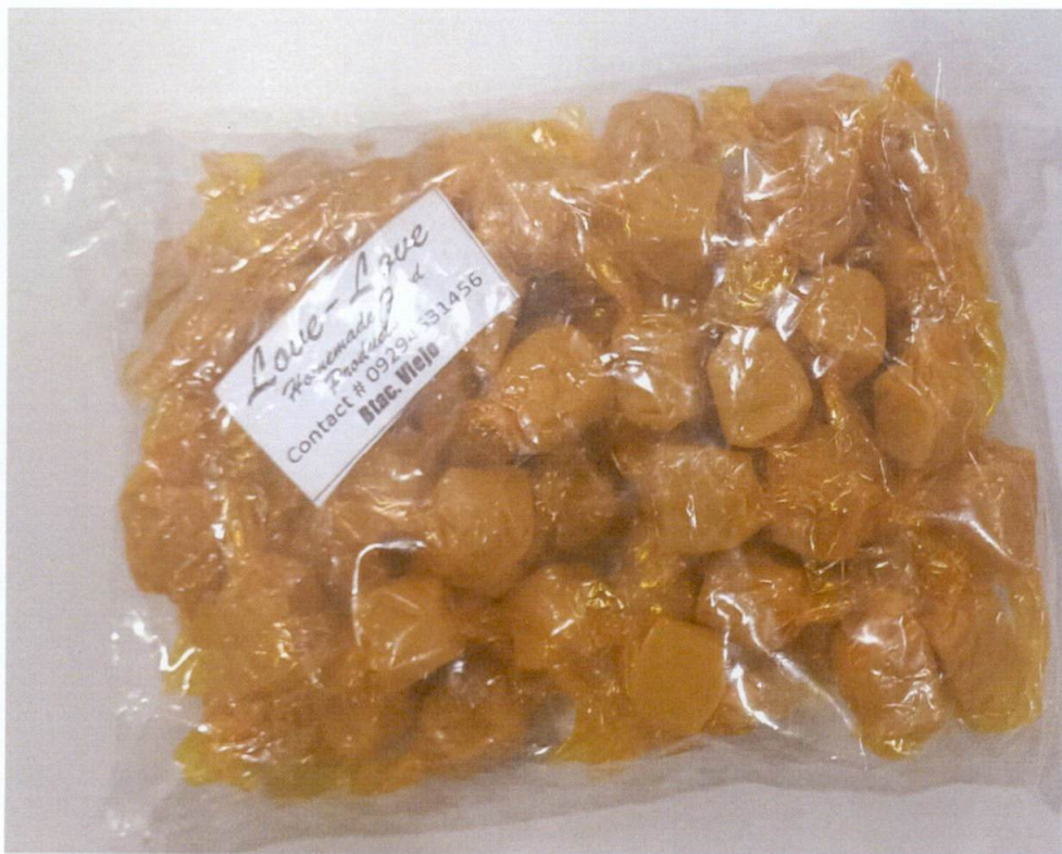
Figure 1. Unregistered LOVE-LOVE Food Product

The Food and Drug Administration (FDA) warns all healthcare professionals and the general public NOT TO PURCHASE AND CONSUME the unregistered food product: