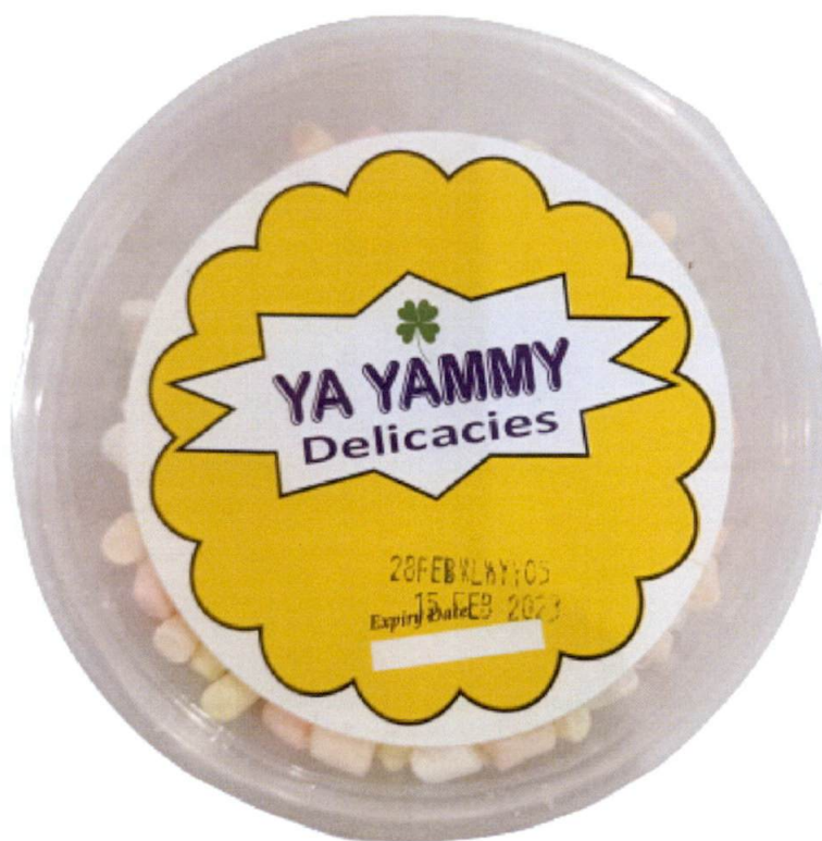
Figure 1. Unregistered YA YAMMY DELICACIES Marshmallows

The Food and Drug Administration (FDA) warns all healthcare professionals and the general public NOT TO PURCHASE AND CONSUME the unregistered food product: