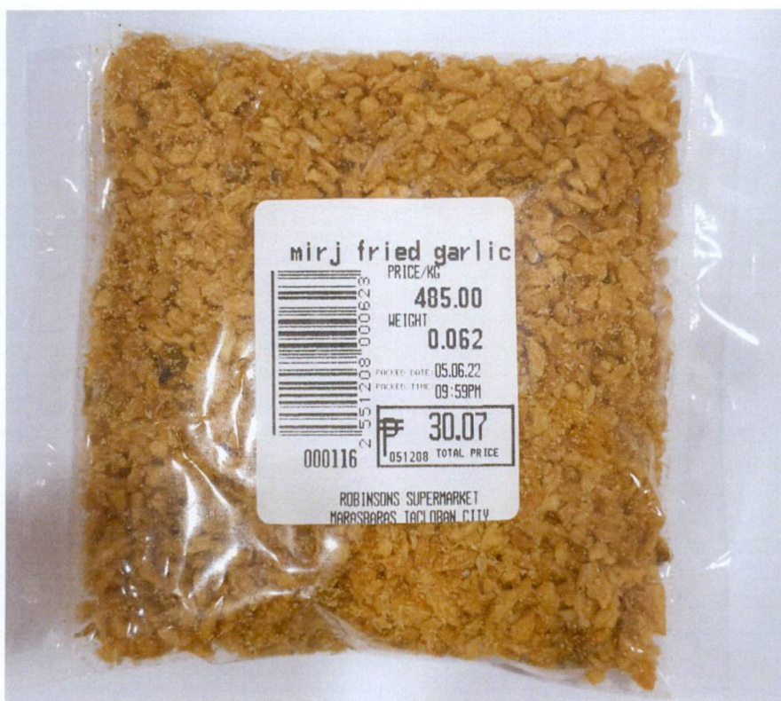
Figure 1. Unregistered MIRJ Fried Garlic

The Food and Drug Administration (FDA) warns all healthcare professionals and the general public NOT TO PURCHASE AND CONSUME the unregistered food product: