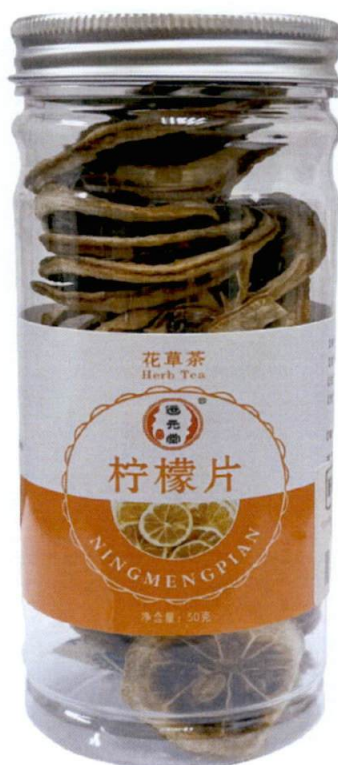
Figure 1. Unregistered NINGMENPIAN Herb Tea - Dried Sliced Lemon (In Foreign Language)

The Food and Drug Administration (FDA) warns all healthcare professionals and the general public NOT TO PURCHASE AND CONSUME the unregistered food product: