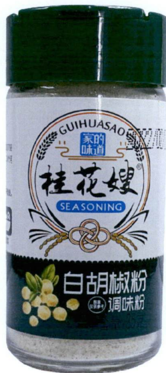
Figure 1. Unregistered GUIHUASAO Seasoning with Image of White Peppercorn Plant in Glass (In Foreign Language)

The Food and Drug Administration (FDA) warns all healthcare professionals and the general public NOT TO PURCHASE AND CONSUME the unregistered food product: