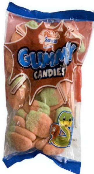
Figure 1. Unregistered PAULA'S SWEETS Gummy Candies

The Food and Drug Administration (FDA) warns all healthcare professionals and the general public NOT TO PURCHASE AND CONSUME the unregistered food product: