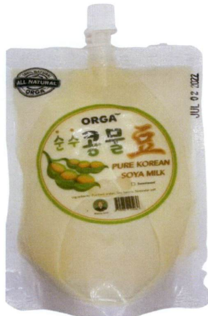
Figure 1. Unregistered ORGA Pure Korean Soya Milk

The Food and Drug Administration (FDA) warns all healthcare professionals and the general public NOT TO PURCHASE AND CONSUME the unregistered food product: