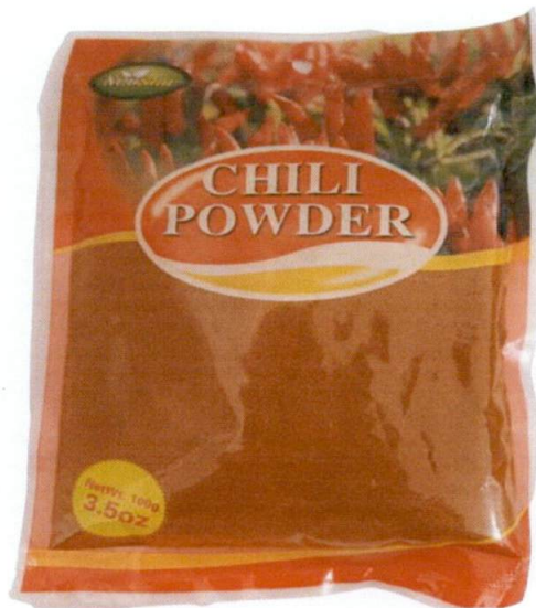
Figure 1. Unregistered NEOSTAR Chili powder

The Food and Drug Administration (FDA) warns all healthcare professionals and the general public NOT TO PURCHASE AND CONSUME the unregistered food product: