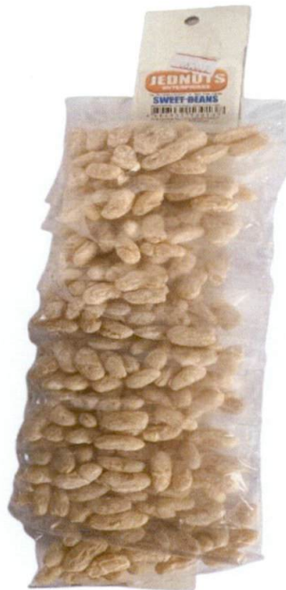
Figure 1. Unregistered SWEET BEANS

The Food and Drug Administration (FDA) warns all healthcare professionals and the general public NOT TO PURCHASE AND CONSUME the unregistered food product: