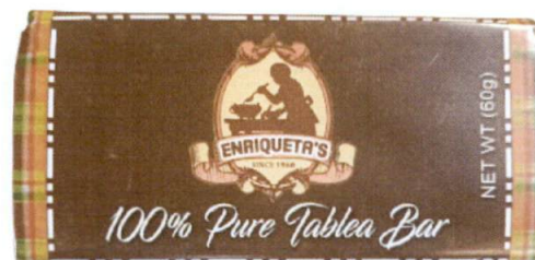
Figure 1. Unregistered 100% Pure Tablea Bar

The Food and Drug Administration (FDA) warns all healthcare professionals and the general public NOT TO PURCHASE AND CONSUME the unregistered food product: