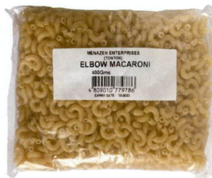
Figure 1. Unregistered MENAZEN ENTERPRISES (TON-TON) ELBOW MACARONI

The Food and Drug Administration (FDA) warns all healthcare professionals and the general public NOT TO PURCHASE AND CONSUME the unregistered food product: